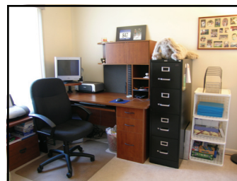
Third Bedroom or Office