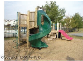
Community Playground