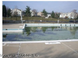
Swimming Pool