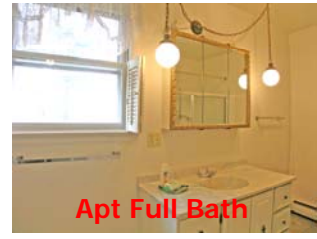
Apt Full Bath