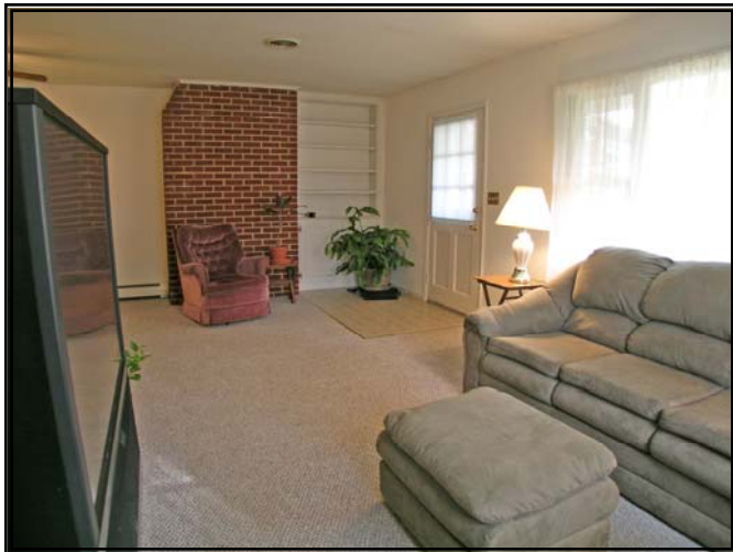
Living Room 20'x12'

Expand your living area or bring the in-laws! Complete "second home" addition, with it's own private entrance. Spotless like new interior. Fully equipped kitchen. No steps on main level. 1 bedroom and full bath. Fully finished basement. Bright sunny interior!