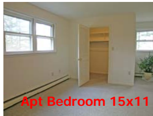
Apt Bedroom 15x11