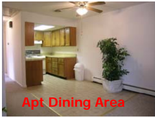
Apt Dining Area