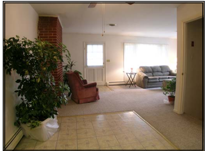
View from Kitchen & Dining Room